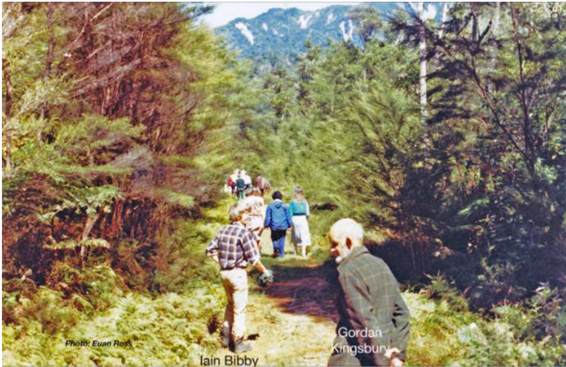
And at the Lodge